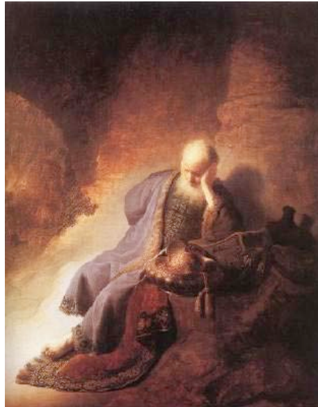
Jeremiah - Lamenting the Destruction of Jerusalem Rembrandt

The Haftorah is read from the book of Yirmiyahu (Jeremiah), 46: 13-28