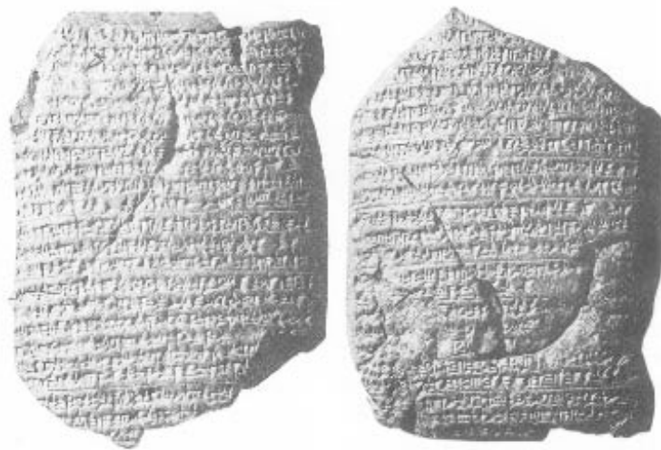
King Nebuchadnezzar's Diary mentioning Jerusalem

would eventually destroy Egypt. All the Egyptians will be sent into exile. So, everybody get ready to march, including the nobleman. There is no hope for victory for the Egyptians. We are explained why Hashem punishes Egypt. It is because of all the hardships that Egypt had oppressed upon the Jews over the years. It's payback time, measure for measure. After the Egyptian exile, they will return to their land. The Haftorah concludes with encouragement from Hashem that if the Egyptians will be permitted to return to their land, then without a doubt the Jews will be able to return from Babylon to their homeland, The Land of Israel.