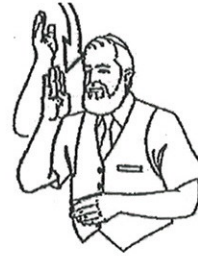
אדוני Adonoy Lord