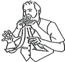
ברוך Boruch Blessed

1. Name: "Hamotzi" - This blessing is said before eating challah, rolls, bread, matzoh, etc.