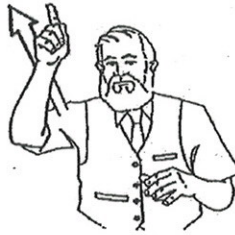
אתה Atoh are you