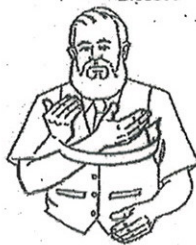
אלהינו Elohaynu our God