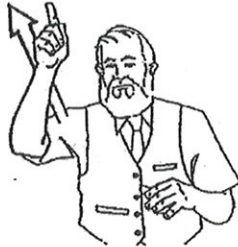
אתה Atoh are you