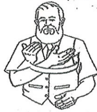
אלהינו Elohaynu our God