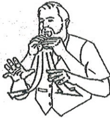
ברוך Boruch Blessed

This blessing is said before eating cookies, cakes, cereals, pasta, etc. made from either wheat, barley, spelt, oats, rye or rice.