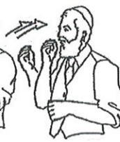
מזונות Mezonos of food.