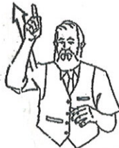
בורא Boray You create