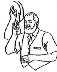
אדוני Adonoy Lord