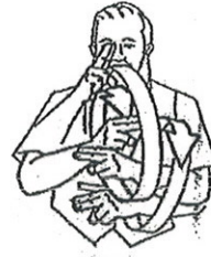
מזונות Mezonos of food.